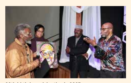
80th birthday celebration in 2023.