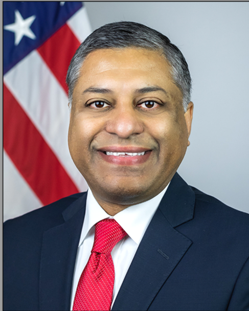
Dr. Rahul Gupta

Director White House Office of National Drug Control Policy