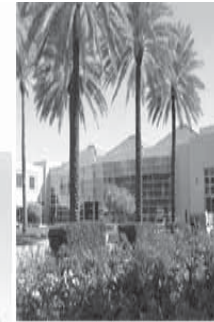
Brand-new Emerald Ballroom