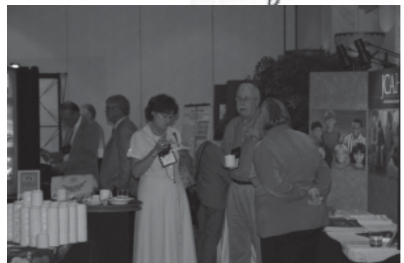
The exhibit area was a natural networking gathering at the 2004 Annual Conference!