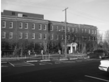
313 West Liberty Street, Lancaster, PA New NAATP Office